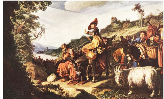
“Abraham on the Way to Canaan,” by Pieter Lastman, 1614

“How can that be?” you may ask. As we look at Scripture, we see over and over where God tells people to strike out on a journey and doesn’t provide all the details. God tells Noah to build an ark a good hundred years before he will need it. God asks Abraham to leave Ur. God has the Israelites traveling in a desert and packing up camp when a cloud lifts and moves. Jesus tells His disciples to “Come follow Me” and doesn’t give