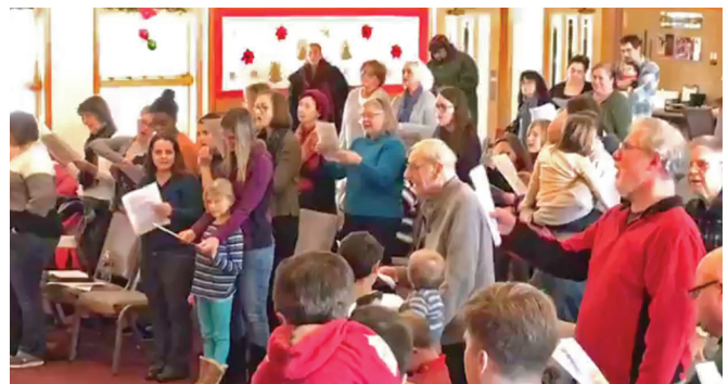
GFCers sing the Hallelujah Chorus at conclusion of an "All Worship Sunday" on December 31, 2017.