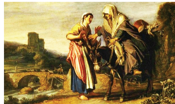
“Ruth and Naomi” by Pieter Lastman, 1614

all the details. When we are walking in faith, we grow in our faith and also in our trust in God. If we know all the answers or exactly where we are going, we can be tempted to trust in our own strength and wisdom rather than in God.