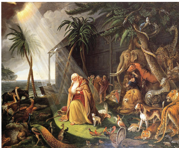
“Noah and His Ark,” (after Charles Catton) by Charles Wilson Peale, 1819.

This January we will be journeying through the book of Ruth together as a congregation. The book of Ruth is a profound narrative about a woman who risks it all to move in faith. She is promised nothing and trusts in God to guide her on a difficult journey. It is my hope that we will learn from her life and examine something of what it means to go in faith even when all the questions are not answered.