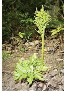
Dissected Grape Fern