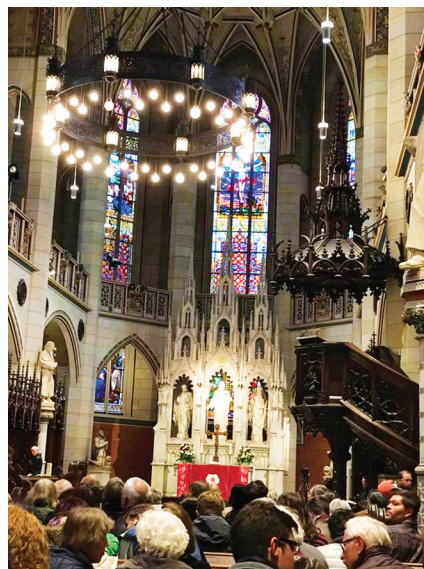
Gottesdienst in the Schloßkirche in Wittenberg on October 31, 2017 —the 500th anniversary of the Protestant Reformation.