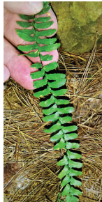
Ebony Spleen Wort