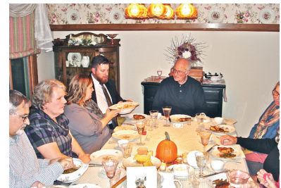
Part of the group eating