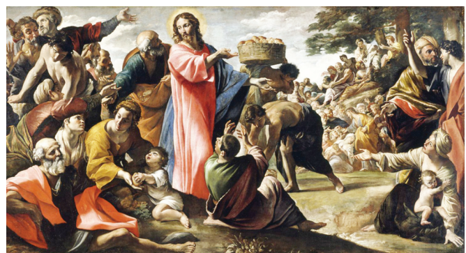
The Miracle of the loaves and fishes by Giovanni-Lanfranco (1620-23)

Perhaps, because we live in a fallen world, our initial response to things seems often to go to the negative—all that is wrong, mentally. BUT we have been raised with Christ! With a little effort on our part we can change how we initially respond to people, situations, conversations, and God. We can see how God is working and moving in someone’s life (or our own) instead of their shortcomings. We can see the blessings of God rather than the results of the curse as our first response.