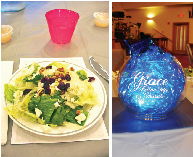
Salad course (left) and table centerpiece (right) as they graced each table upon the guests’ arrival