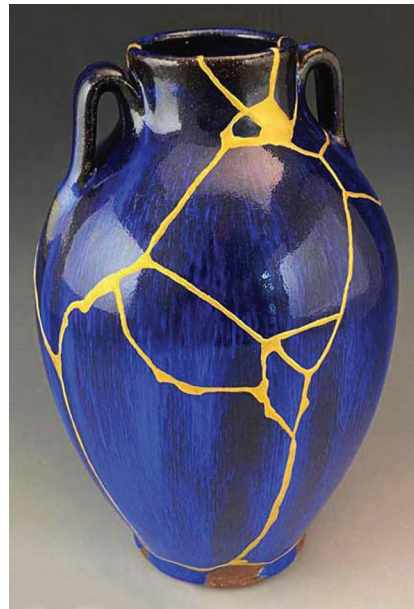
A Kintsugi blue vase made for Lorenzo de Mdici.

The other day I was watching a YouTube video about sushi, and the video mentioned that the sushi was being served in a Kintsugi dish. I had not heard of that before and looked it up. I learned that Kintsugi means “golden joiner” in Japanese. Wikipedia says: “Kintsugi is the Japanese art of repairing broken pottery by mending the areas of breakage with urushi lacquer dusted or mixed with powdered gold, silver or platinum. As a philosophy, it treats breakage and repair as part of the history of an object, rather than something to disguise .”